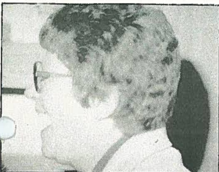
"You gave up WHAT for Lent?"