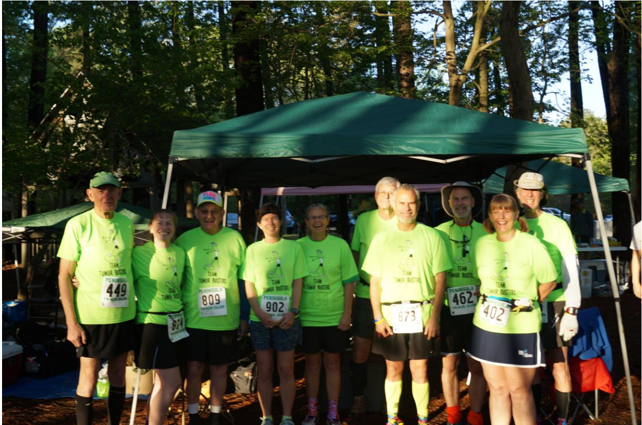
Team Tumor Busters on April 26 th .